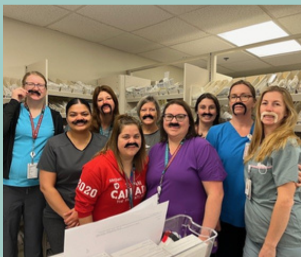
Pharmacy staff raising awareness of men's health during November.

During November, the Woodstock Hospital Wellness Committee sold moustaches to raise awareness for men's health issues.